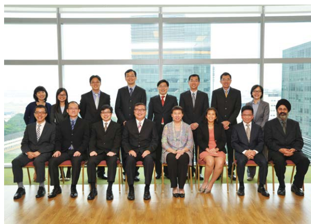
通訊辦於 2014 年 7 月 3 日到訪新加坡，與 IDA 舉行年度交流會議。OFCA visited Singapore for the annual bilateral meeting with the Infocomm Development Authority of Singapore (“IDA”) on 3 July 2014.

During the year, we attended a joint meeting in Shenzhen with the Director-Generals of Communications Administration of the Central and Southern Mainland Regions and an annual bilateral meeting in Singapore with the Infocomm Development Authority of Singapore.