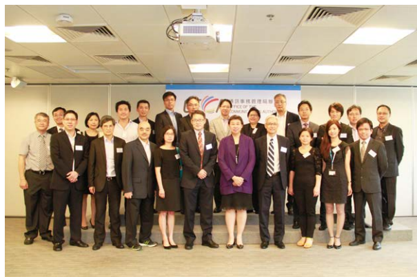
我們於 2014 年 6 月舉行午宴，答謝各諮詢委員會委員所作的貢獻。A lunch reception was held in June 2014 to thank the members of the advisory committees for their contribution.

The World Telecommunications and Information Society Day - Hong Kong 2014 sponsored by OFCA has successfully enhanced youth awareness of Information Communications Technology.