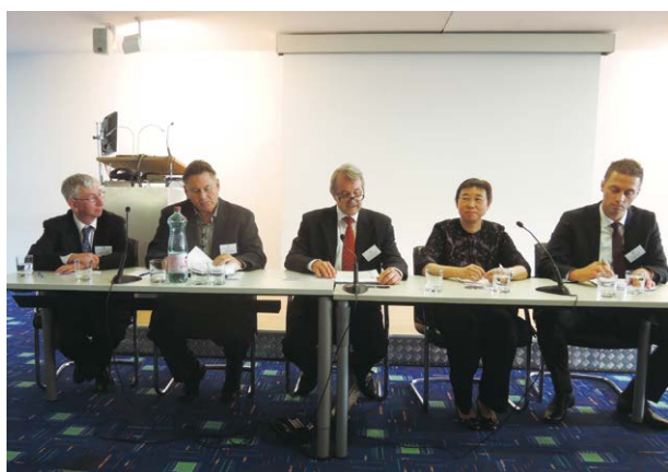
通訊辦於2014年10月參與國際通信協會國際監管機構論壇暨年會。OFCA attended the International Regulators Forum and Annual Conference of the International Institute of Communications in October 2014.

在2014/15年度，我們共出席25個論壇／會議。舉辦這些論壇／會議的地區及國際組織包括國際電聯、亞太經濟合作組織(「亞太經合組織」)、亞太地區電信組織(「APT」)和國際通信協會。年內較大型的活動包括國際電聯全權代表大會、國際電聯全球監管機構專題研討會、國際通信協會國際監管機構論壇、亞太經合組織電訊部長會議及APT亞太資訊及通訊科技部長會議。我們將繼續參與國際電聯、亞太經合組織電訊及資訊工作小組和APT的活動，以改善亞太區內電訊及資訊基礎建設為目標。