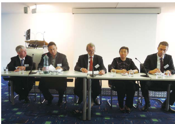
通訊辦於2014年10月參與國際通信協會國際監管機構論壇暨年會。OFCA attended the International Regulators Forum and Annual Conference of the International Institute of Communications in October 2014.

在2014/15年度，我們共出席25個論壇／會議。舉辦這些論壇／會議的地區及國際組織包括國際電聯、亞太經濟合作組織(「亞太經合組織」)、亞太地區電信組織(「APT」)和國際通信協會。年內較大型的活動包括國際電聯全權代表大會、國際電聯全球監管機構專題研討會、國際通信協會國際監管機構論壇、亞太經合組織電訊部長會議及APT亞太資訊及通訊科技部長會議。我們將繼續參與國際電聯、亞太經合組織電訊及資訊工作小組和APT的活動，以改善亞太區內電訊及資訊基礎建設為目標。