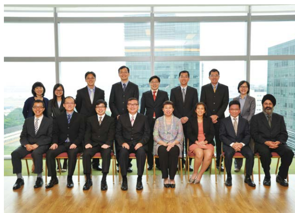
通訊辦於2014年7月3日到訪新加坡，與IDA舉行年度交流會議。OFCA visited Singapore for the annual bilateral meeting with the Infocomm Development Authority of Singapore (“IDA”) on 3 July 2014.

During the year, we attended a joint meeting in Shenzhen with the Director-Generals of Communications Administration of the Central and Southern Mainland Regions and an annual bilateral meeting in Singapore with the Infocomm Development Authority of Singapore.